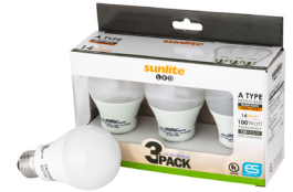
3 Pack Box